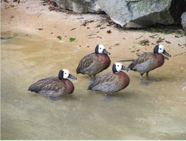
taken at San Diego Zoo