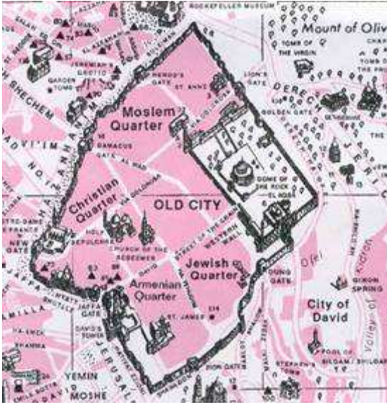
Mary Craig Ministries, Inc.