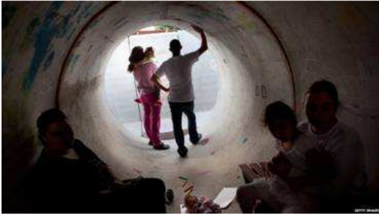
A family in a similar bunker for protection

Kroy summed up the mission in three words: Power, People, and Peace . They saw and felt the power of God on this mission as God led them to various people from many places around the world in order to feel the pulse of the Church. The Peace was in them, not in what was going on around them, as for example, when the sirens blasted a warning to take cover from incoming rockets and they found themselves right by a huge concrete bunker for protection. They felt the Peace of Christ with them even as a woman came out from her home in the wall, shouting in fear for herself and her child. They assured her they would stay until all was calm; and they did.